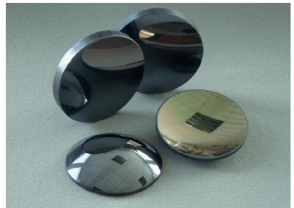
Typical delivery in form of blanks:

VITRON currently produces 5 different types of Chalcogenide Glass that are applicable to optics and optoelectronics system design.