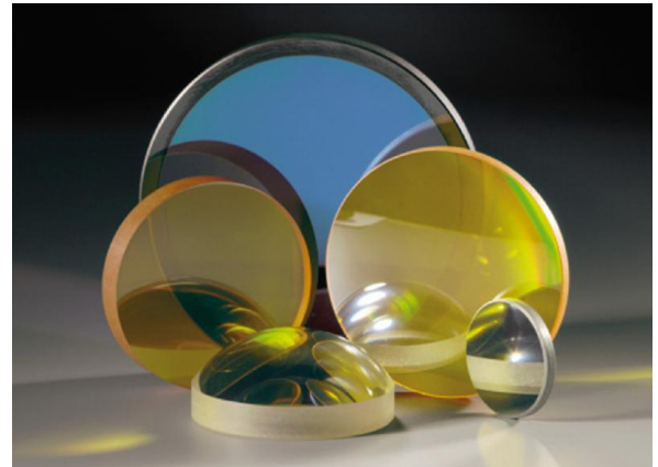
Typical delivery in form of blanks:

Classical polishing or Single-Point-Diamond-Machining enables the production of optical components with flat, spherical and/or aspherical and diffractive surfaces. Antireflection coatings can be applied to further improve the transmission.