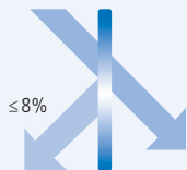
Conventional Float Glass: \leq 8\%